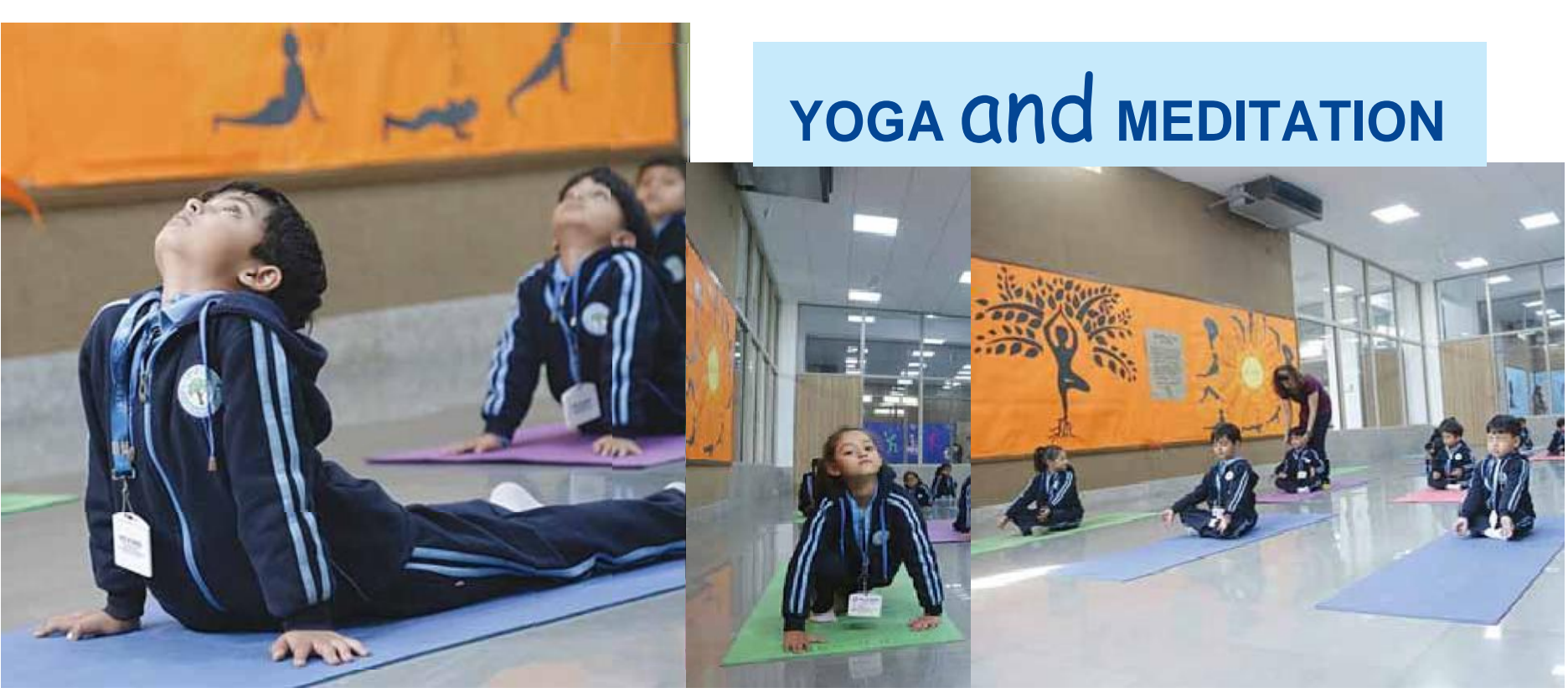
The power of Yoga and meditation has been incorporated in our curriculum, as we believe it is a complete package of fitness of mind body and soul. The school's vision of holistic development of students is met by practicing this wonderful form also known as 'Nirvana'.

Step up school encourages all students to get involved into practical communication skills and become a skilled speaker. To fulfill this need, we provide a spacious and well equipped Public speaking room in Step Up School. Public speaking classes in our school are well strategized, focused, and impart structured training to future leaders.